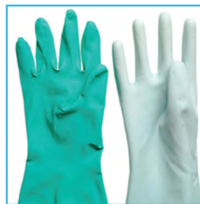
Lined for comfort